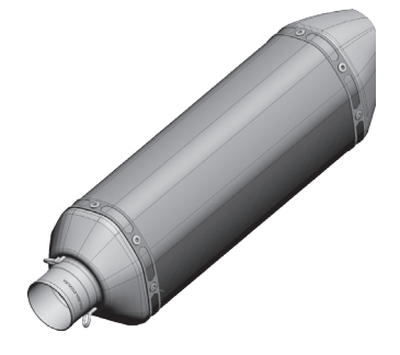
SERIAL NUMBER POSITION